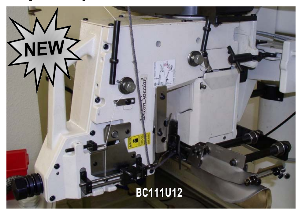
High speed and high performance automatic two or single thread bag closing machines for closing filled sacks and bags. Automatic guillotine cuts crepe tape or thread chain with or without filler cord. Internal forced lubrication system in closed shell design casting. Low noise and vibration.